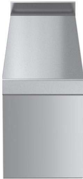
589153 (MCNABBB000) Closed Work Top, one-side operated with backsplash